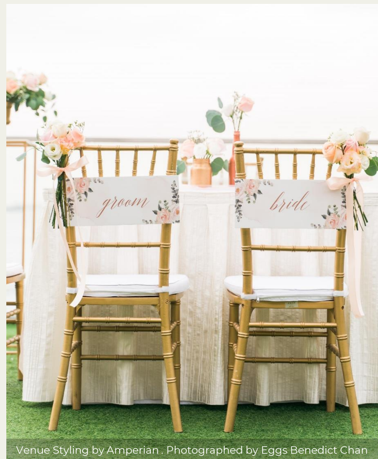
Venue Styling by Amperian . Photographed by Eggs Benedict Chan