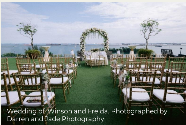
Wedding of Winson and Freida.