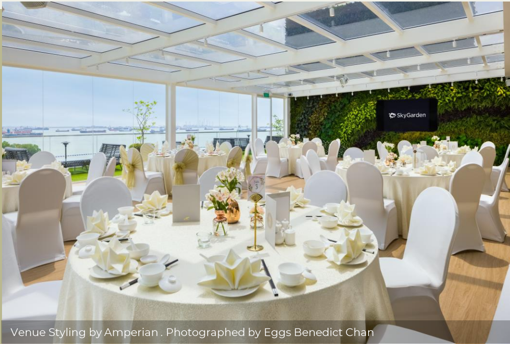
Venue Styling by Amperian . Photographed by Eggs Benedict Chan

Sky Garden is sprucely equipped with a fully air-conditioned indoor space that can accommodate up to 150 guests (seated). Whether you are in search for an intimate, outdoor garden wedding, or an elaborate indoor setting, we've got you covered; this indoor space is also readily available as an alternate location in the event of undesirable weather conditions.