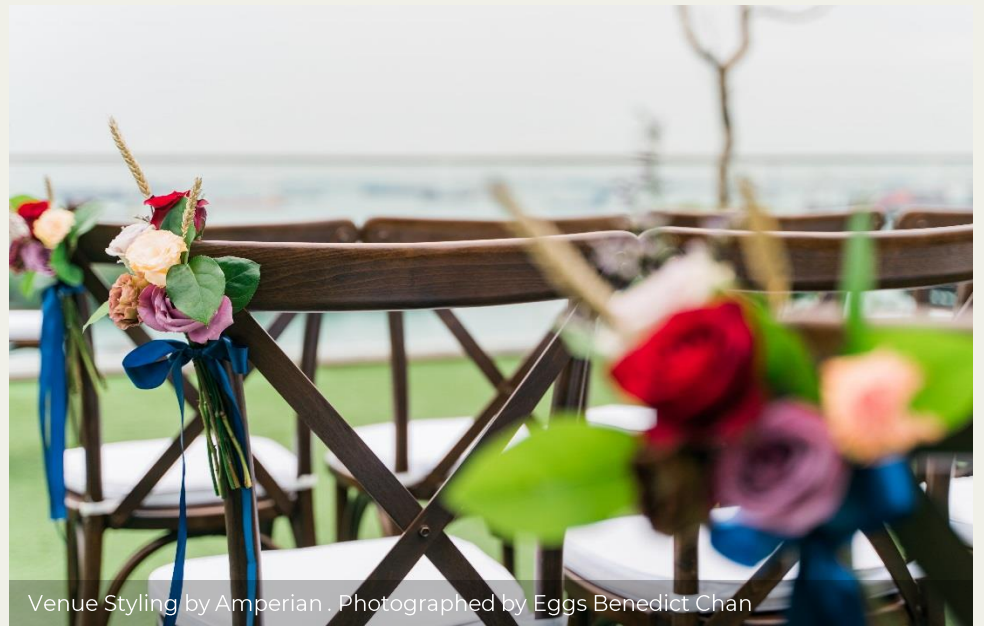
Venue Styling by Amperian . Photographed by Eggs Benedict Chan