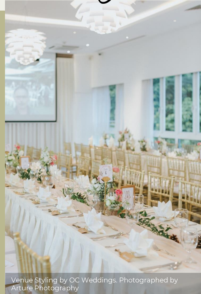
Venue Styling by OC Weddings.

Sky Garden is sprucely equipped with a fully air-conditioned indoor space that can accommodate up to 150 guests (seated). Whether you are in search for an intimate, outdoor garden wedding, or an elaborate indoor setting, we've got you covered; this indoor space is also readily available as an alternate location in the event of undesirable weather conditions.