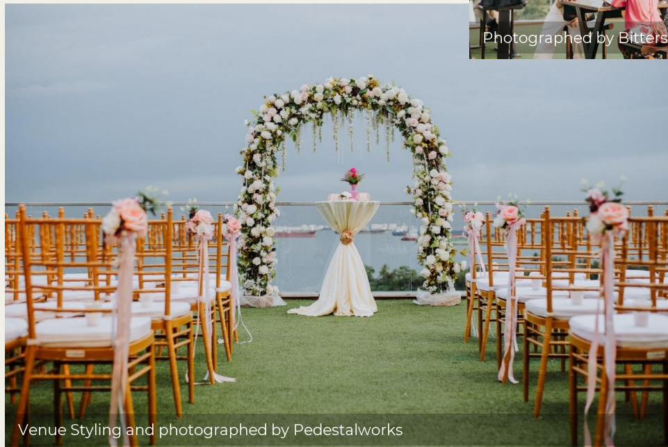
Venue Styling and photographed by Pedestalworks