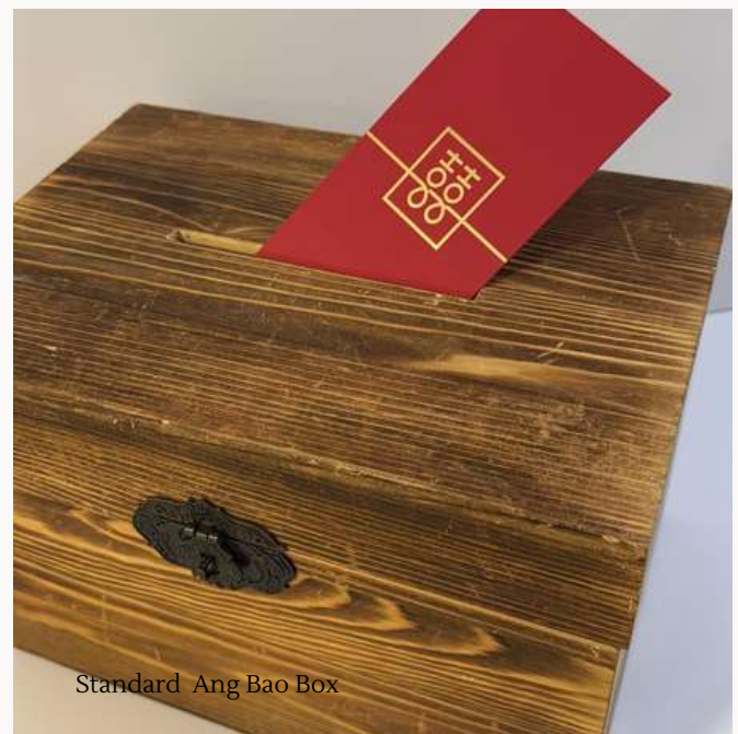
Standard Ang Bao Box