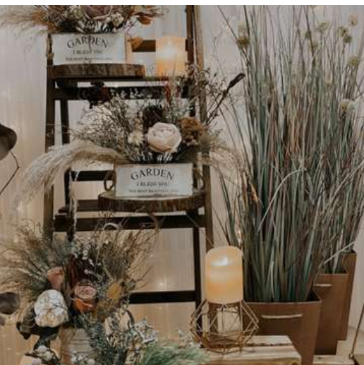
R U S T I C B O H O