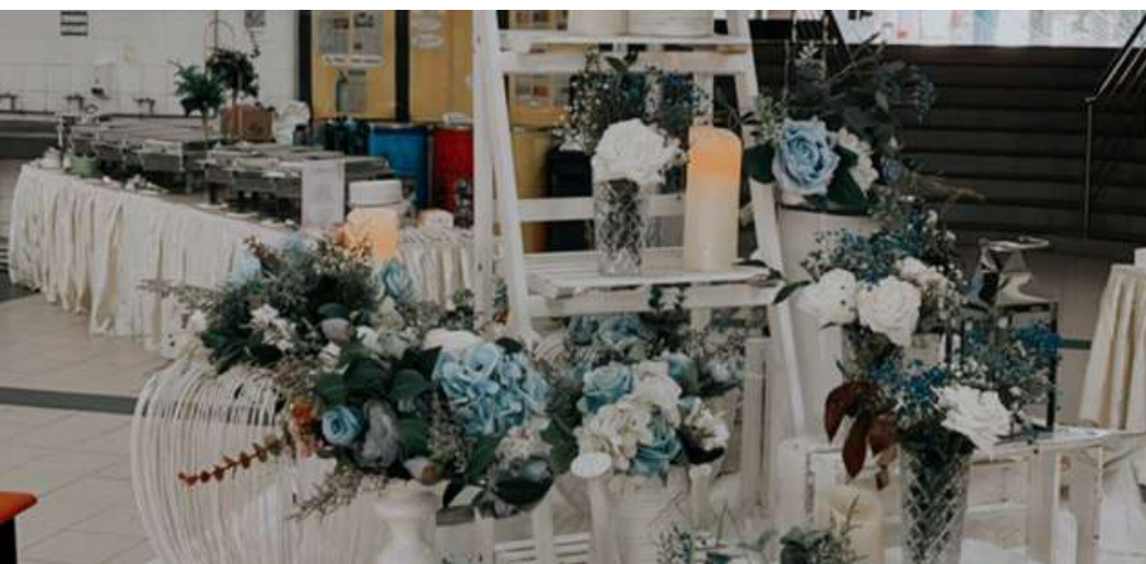
B L U E S Y M P H O N Y

ONLY VALID WITH PURCHASE OF CAFE MANNA WEDDING PACKAGE 2025/26.