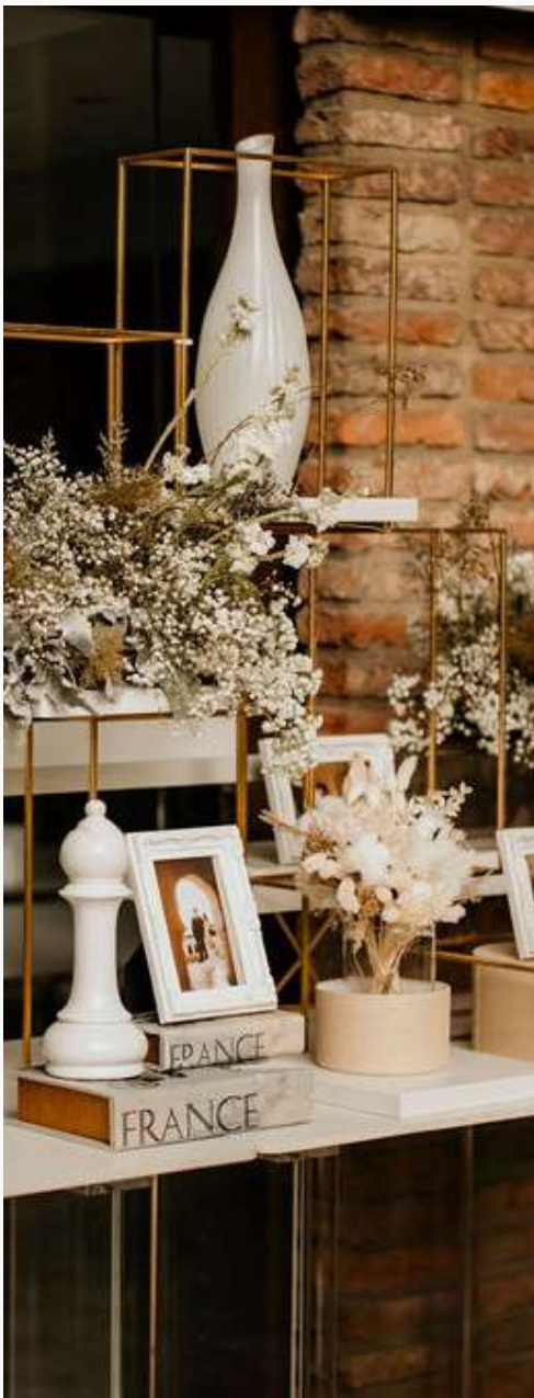
Reception Area Styling: Props, Florals & Decor with ten photoframes