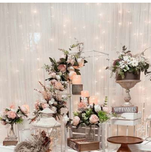
P I N K M A R T I N I