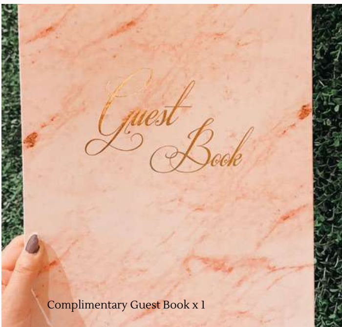
Complimentary Guest Book x 1